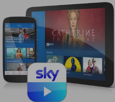
SKY GO 6"