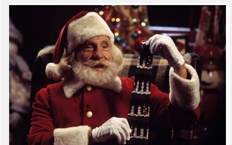
Call Me Claus