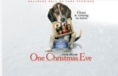
One Christmas Eve