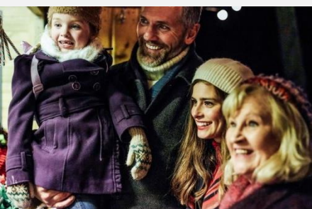
A Very Yorkshire Christmas