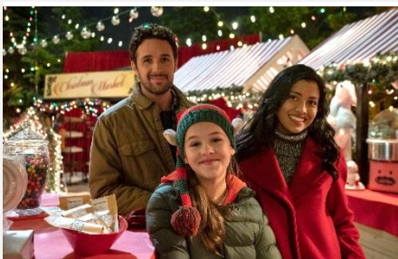
A Gingerbread Christmas