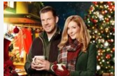
Welcome to Christmas