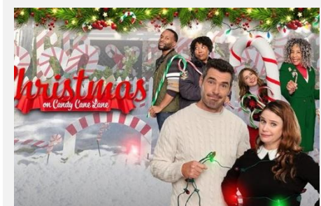
Christmas on Candy Cane Lane