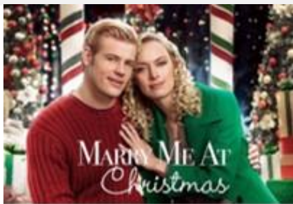
Marry Me At Christmas