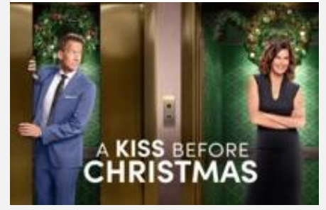
A Kiss Before Christmas