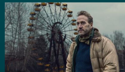
Inside Chernobyl w/ Ben Fogle