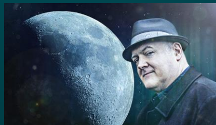
Wonders of the Moon with Dara Ó Briain