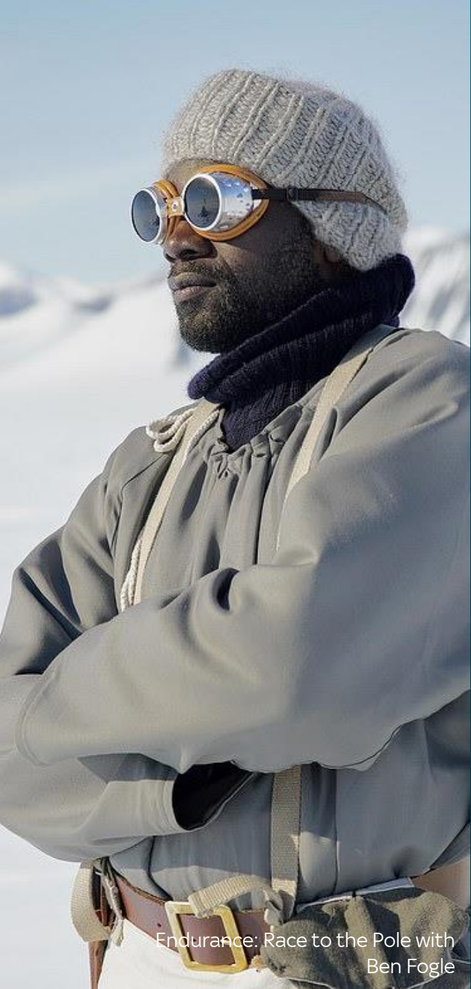
Endurance: Race to the Pole with Ben Fogle