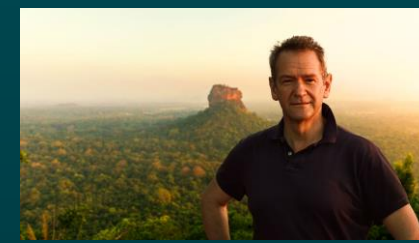
Alexander Armstrong: Sri Lanka